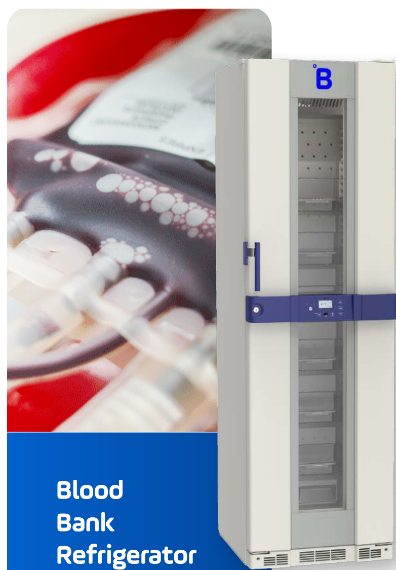
Blood Bank Refrigerator

TGAC is a laboratory specialized in clinical analysis, through which its main objectives are the diagnostic support for the prevention and treatment of diseases. Specialized in molecular infectious diseases, immunogenetics, ontogenetic and cellular markers, TGAC's mission is to provide accurate results to its clients in a timely manner, taking full advantage of the technological infrastructure, knowledge, and values of human capital in order to contribute to a higher quality of life.