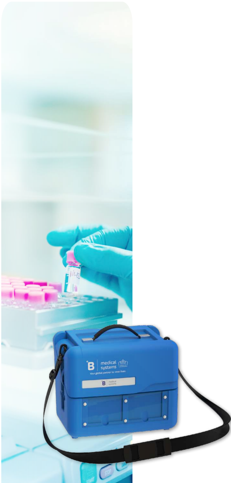
Medical Transport Box